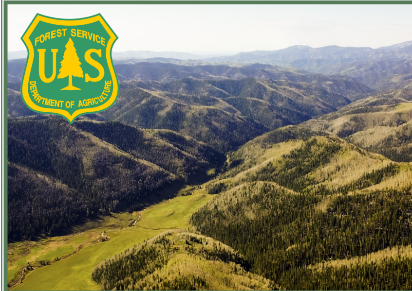
Hermosa Creek looking South

Public Scoping Open House, Tuesday, March 3, 2015 San Juan Public Lands Center